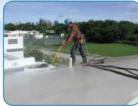
Concrete roof application 25,000 sq. ft. area