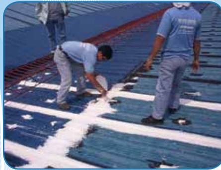
Reinforcement of seams with primer prior to EPDM application