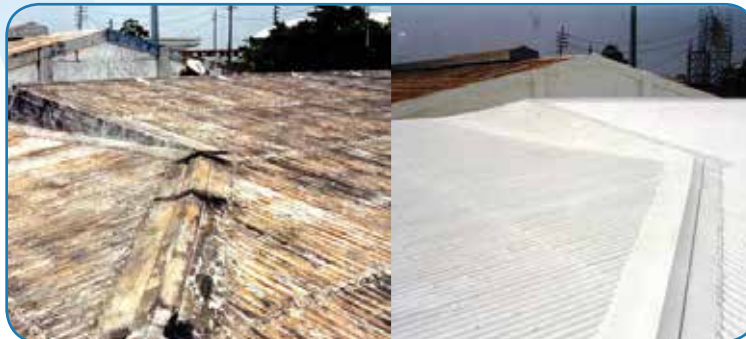
Before and after pictures of application on metal with rust. Rust did not need to be removed