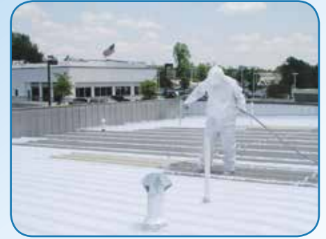
Sprayed application on corrugated metal