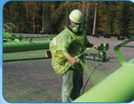
Custom color on metal pipeline airless